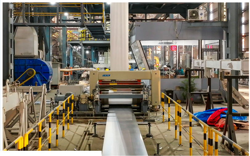
Shyam Metalics, Jamuria